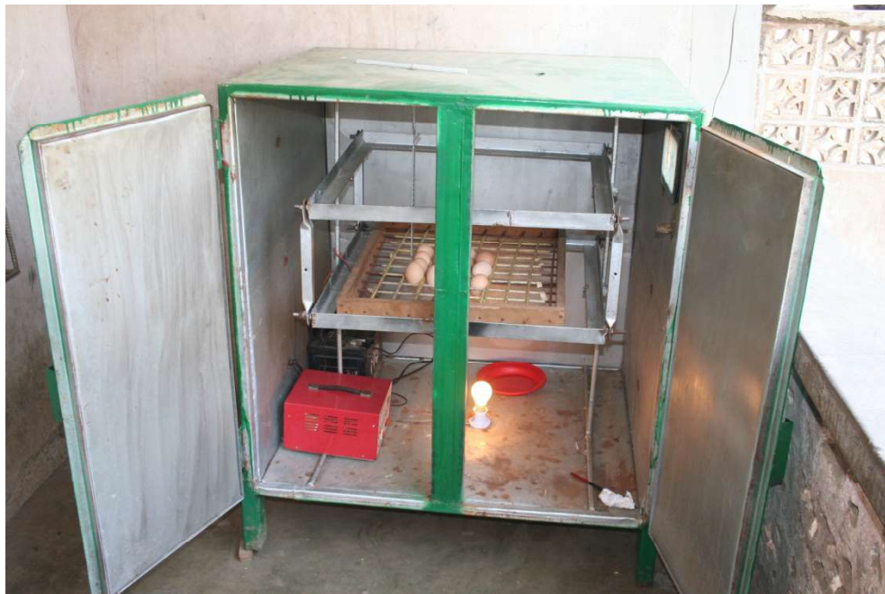
Figure 3. Fabricated low cost semi- automated incubator showing eggs for incubation