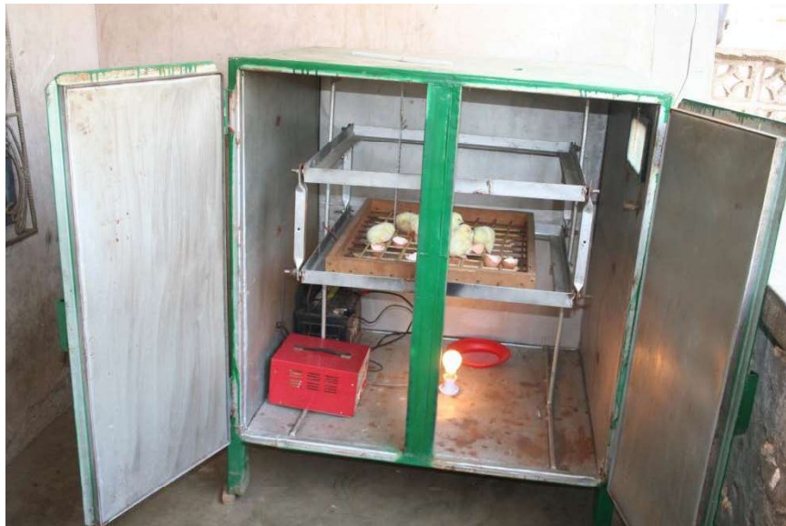
Figure 4. Low cost semi-automated incubator showing hatched eggs